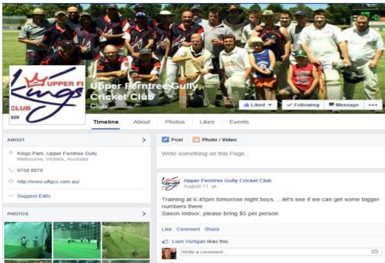
The UFTGCC Facebook Page.