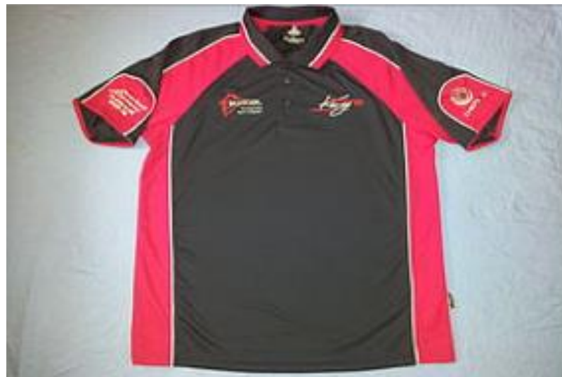
The UFTGCC Social Shirt.